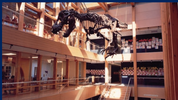
Brunswick School, New Brunswick, CT