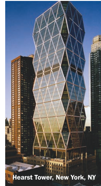
Hearst Tower, New York, NY

programs, prior Turner interns are given strong consideration for full-time employment after graduation.