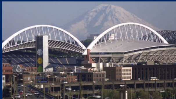
Seahawk Stadium, Seattle, WA

To learn more about Turner or to apply for one of our opportunities, please visit us at www.turnerconstruction.com/campus .