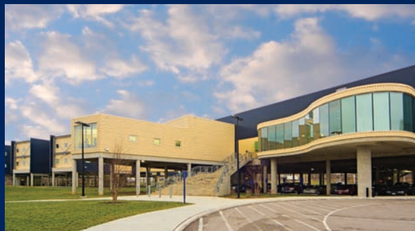
Riverview East Academy, Cincinnati, OH